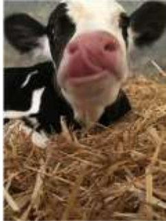
Bean the Calf